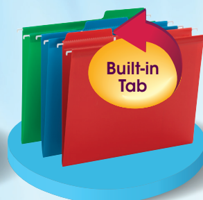
FasTab® Hanging Folders