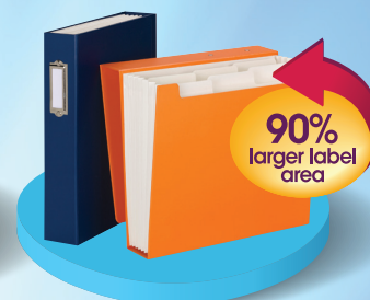
Bookshelf Organizers with SuperTab®