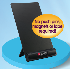
Justick™ Electro Boards